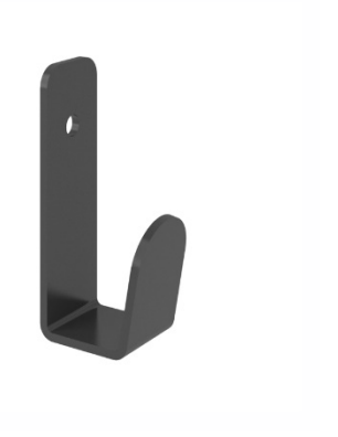
Metal hook for clothes