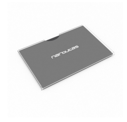
Plexiglas name card holder