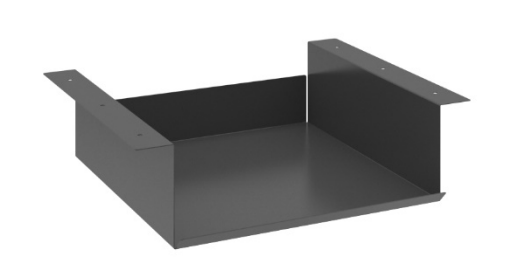
Metal shelf (central) for doors with mail slot

Customize your locker by using additional items.